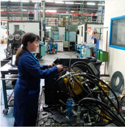
Engineering generates work and incomes.