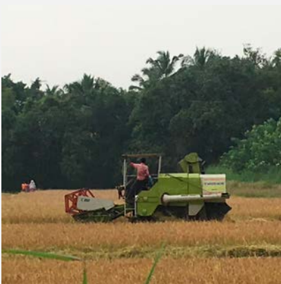
Engineered mechanization of farming for food production in India.