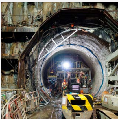
Engineering infrastructure, such as this underground metro tunnel, is essential for sustainable development.