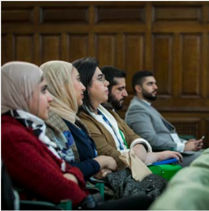
Young engineers learning about engineering and sustainable development.