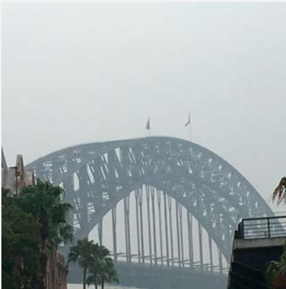
The impacts of climate change, caused intense bush fires and smoke haze over Sydney, January 2020. © Marlene Kanga