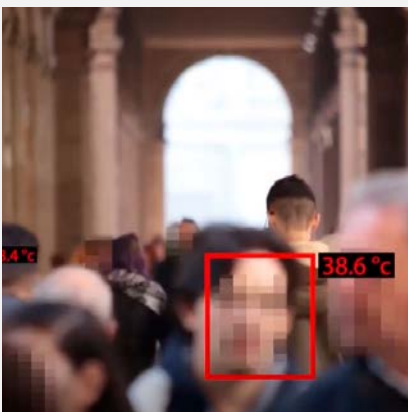
Artificial Intelligence camera vision for COVID-19 fever detection in crowds.