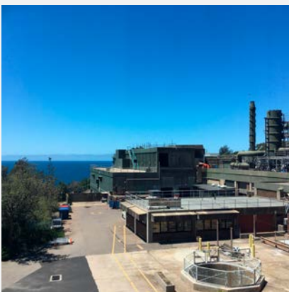
Biogas from treated sewage used to generate electricity at North Head Wastewater Treatment Plant, Sydney, Australia.