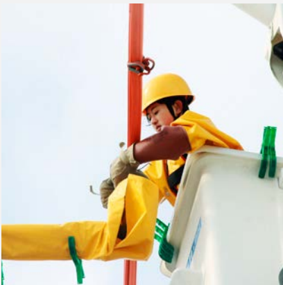
Women engineers working on high voltage electrical systems.