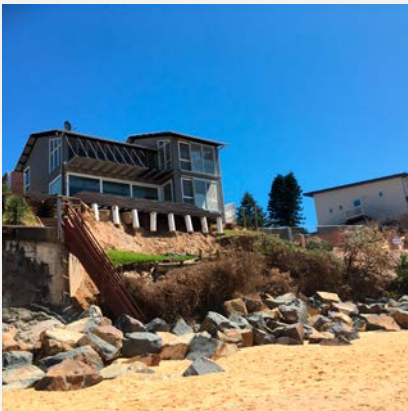
Engineering is needed to protect against rising sea levels and increasing beach erosion in coastal communities.