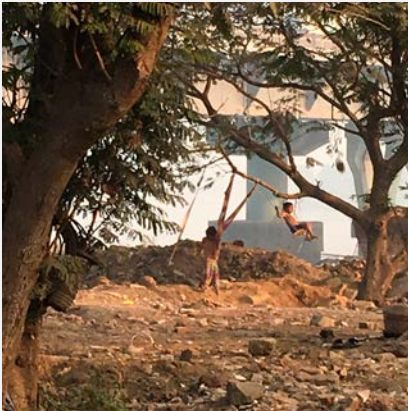
Engineering can address extreme urban poverty.