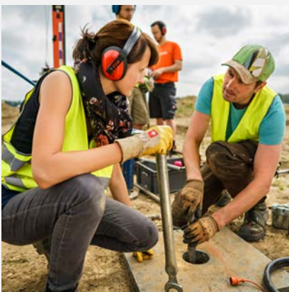
Geo-engineering innovation is essential for discovering and protecting the Earth's resources.